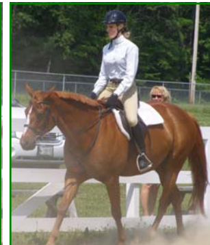
Crystal Clukey Reserve Championship